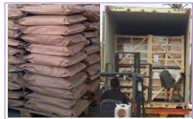
C) paper bags palletized or in loose