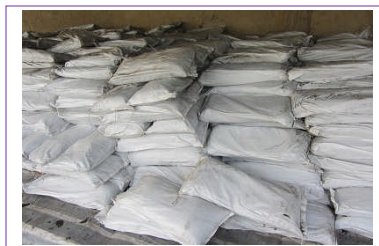
B) Fusible bags in Polybags in loose